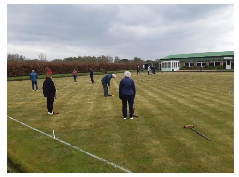
The first Roll Up at Hatfield Peverel 18th April 2023; bitterly cold but didn't stop 20 members playing in this inaugural Roll Up